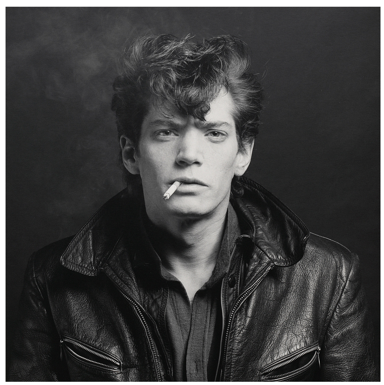
Self Portrait