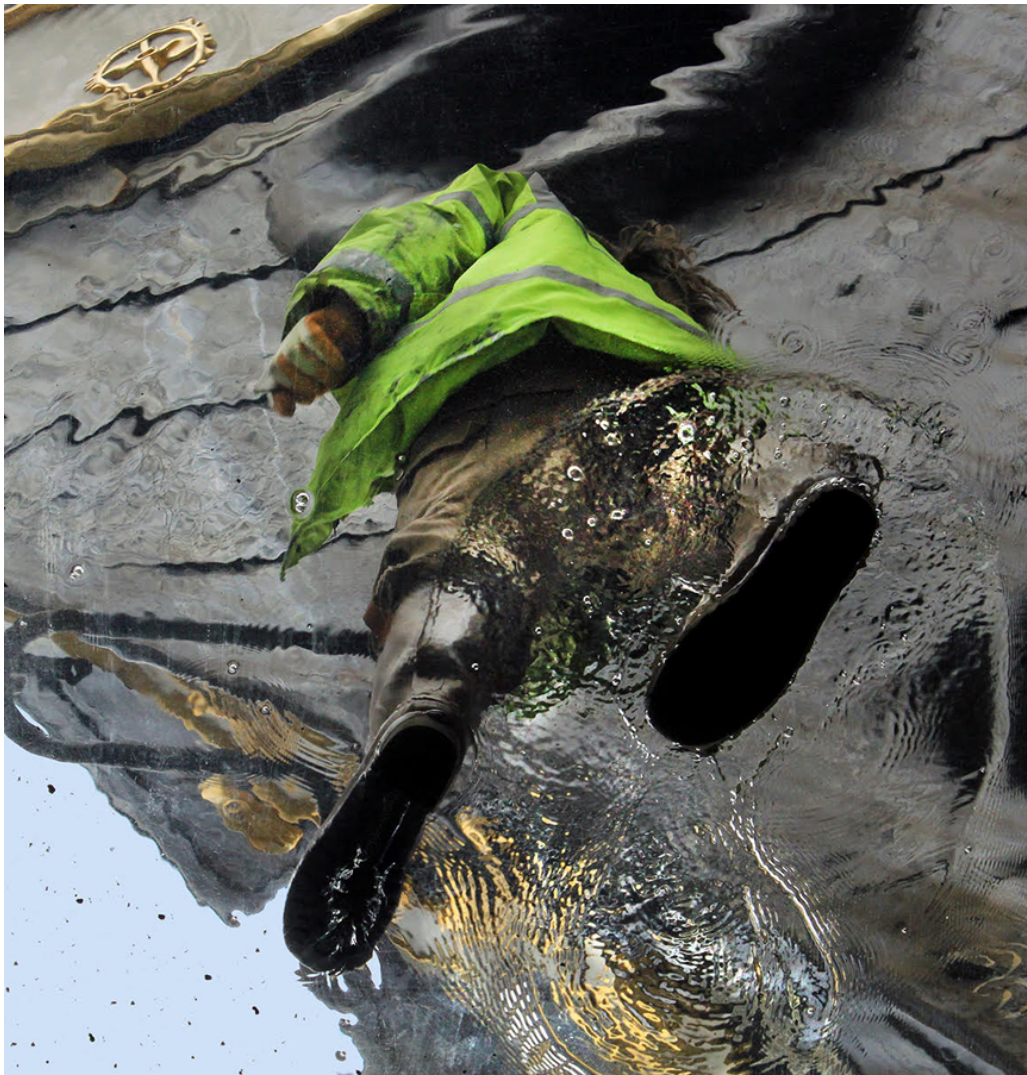
SS Great Britain through the water