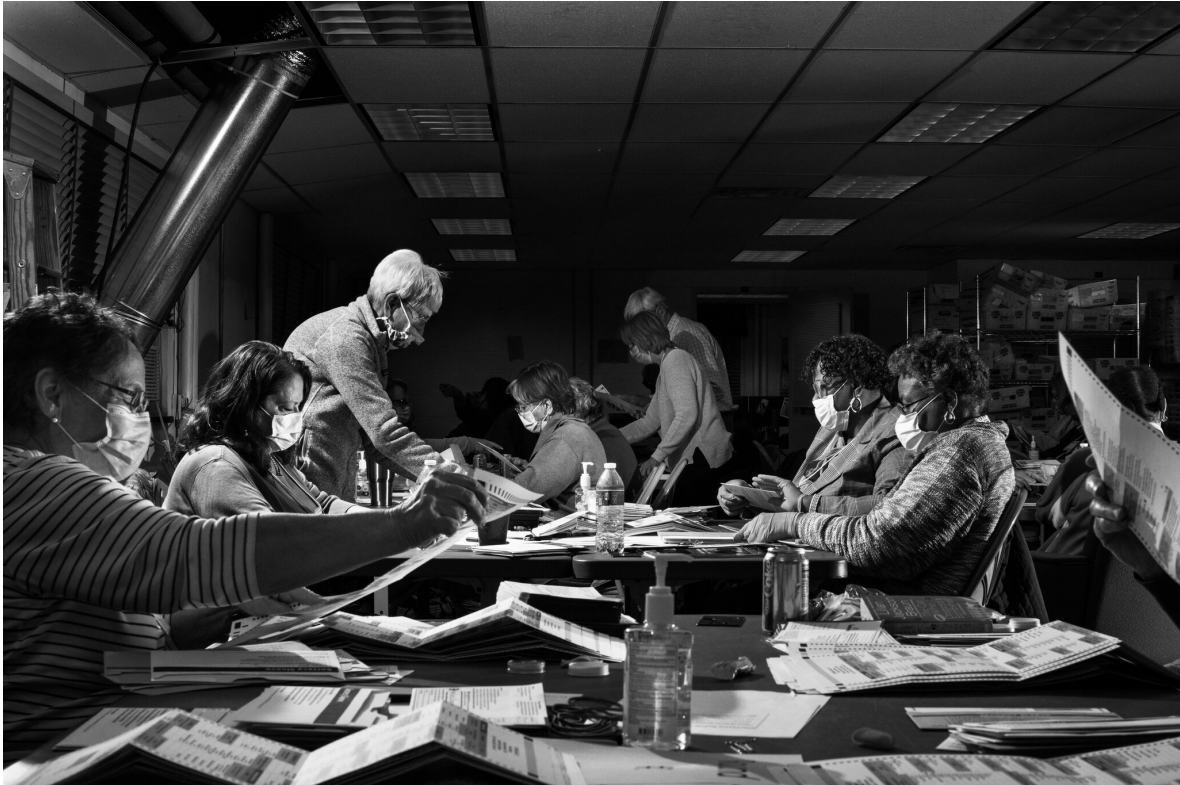
Lansing, Mich., Nov. 3 Counting ballots on election night. Joseph R. Biden Jr. narrowly won the state, and President Trump contested the results, filing a flurry of lawsuits in Michigan and other states he lost.