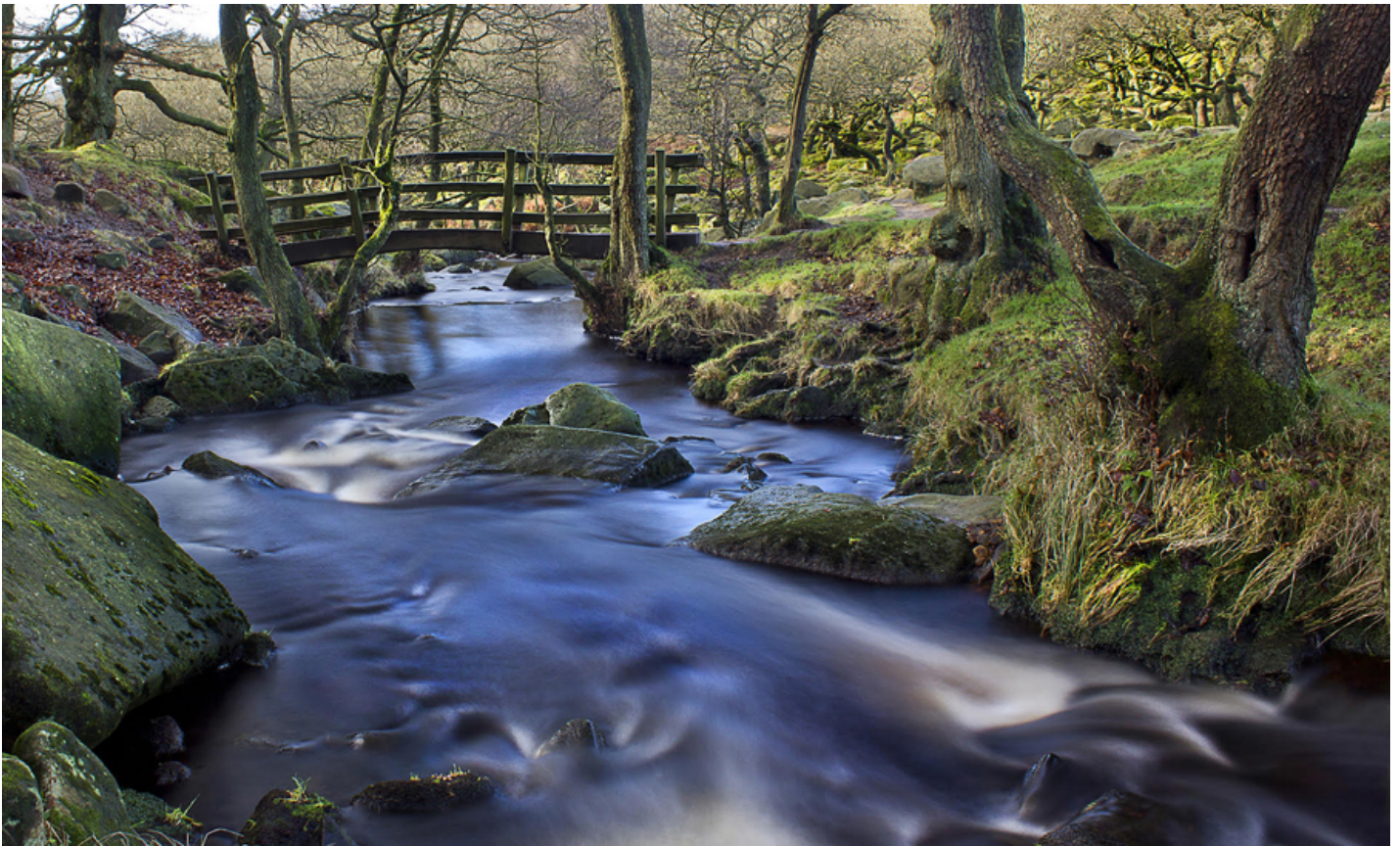
Padley Gorge