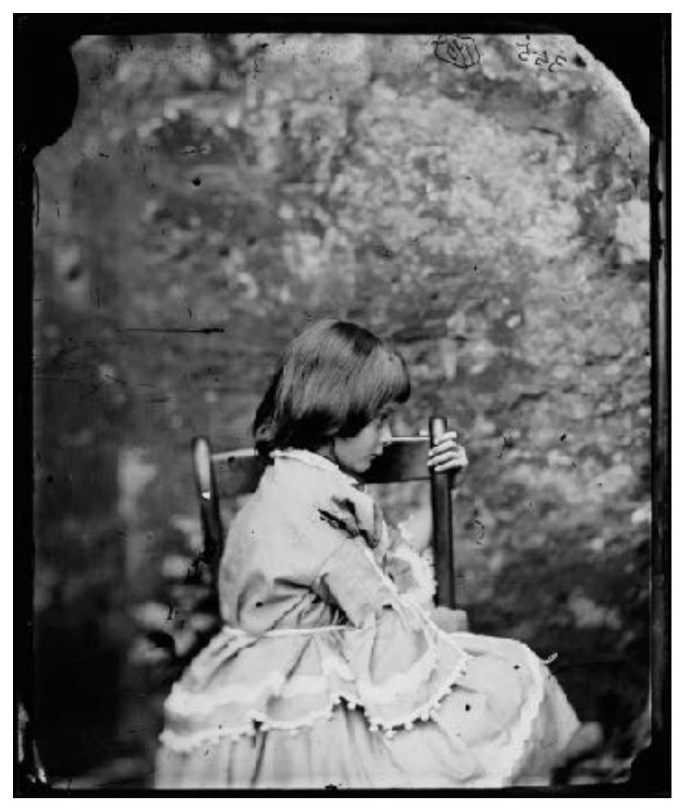
© Alice Liddell by Lewis Carroll, 1858