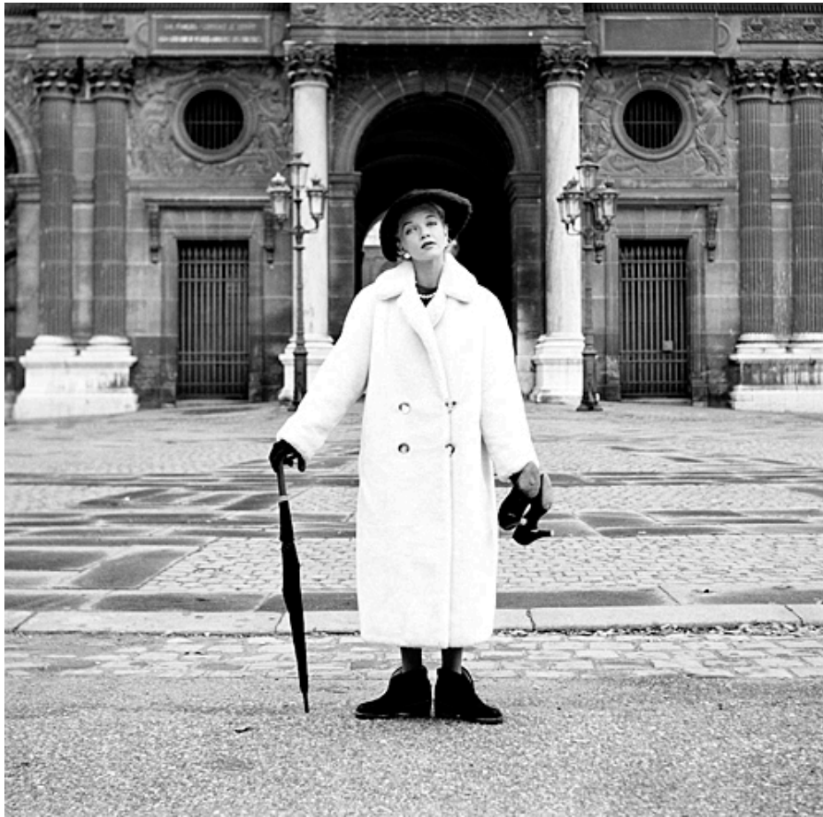
Model having fun at the end of the fashion shoot, Ready-to-wear, Louvre, Paris, circa 1950.