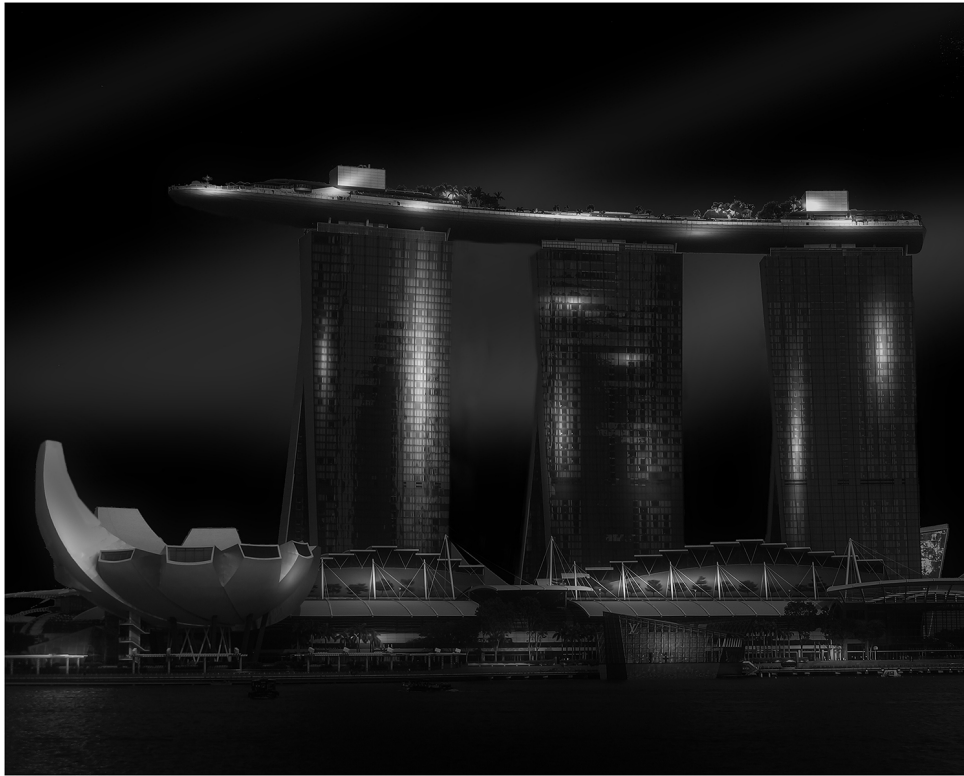
Marina Bay Sands