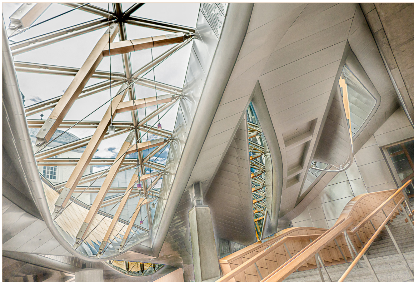
Inside the Scottish Parliament