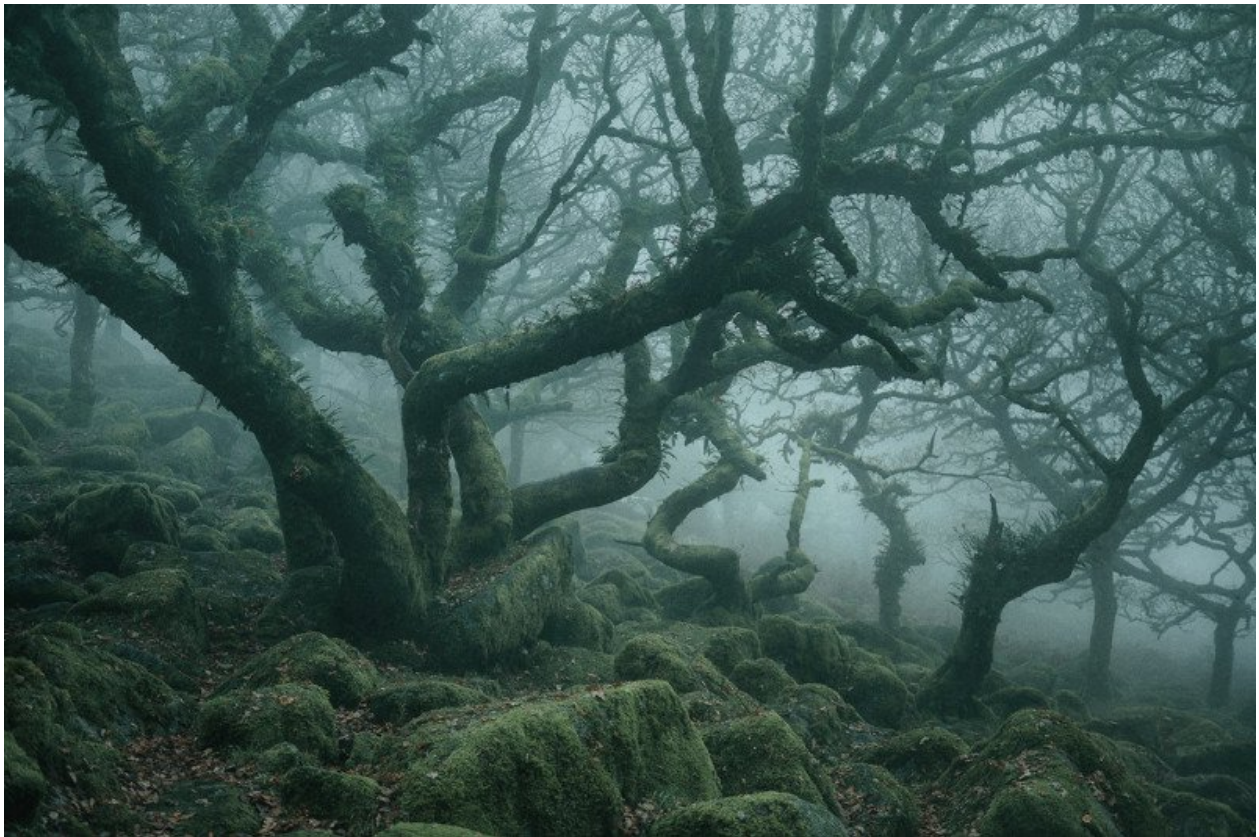
Wistman's Wood

Burnell tells Colossal that although he has visited the wood around 20 times in just the past year, it has only been misty on two of the trips. He also tries to visit during blue hour immediately before the sun rises in the morning. The photographer says he'll continue to visit Wistman's Wood and hunt for the right weather and lighting conditions to add to this series. You can follow along and find more of Burnell's work on his website , Facebook , Twitter , and Instagram .