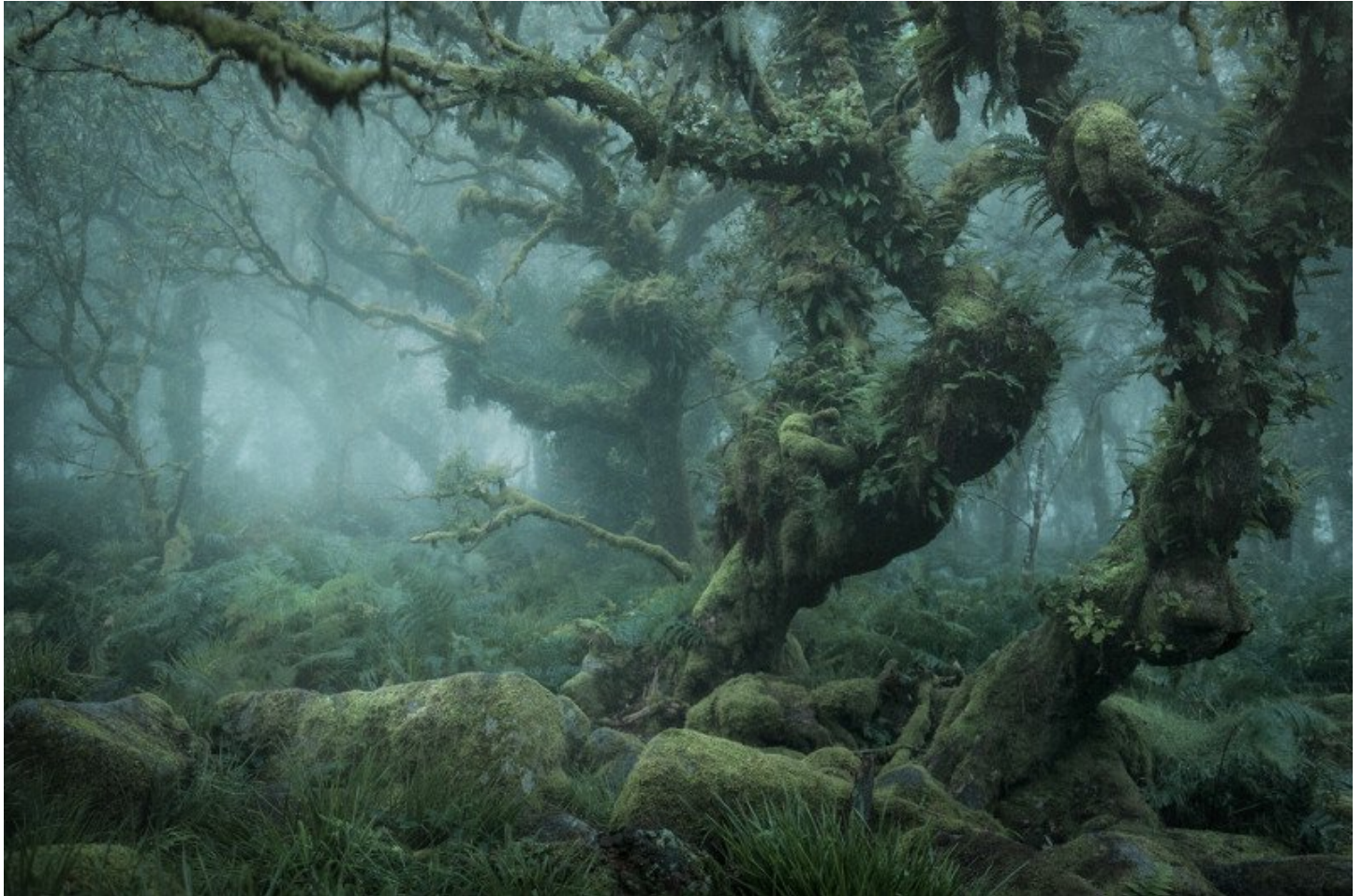
Wistman's Wood