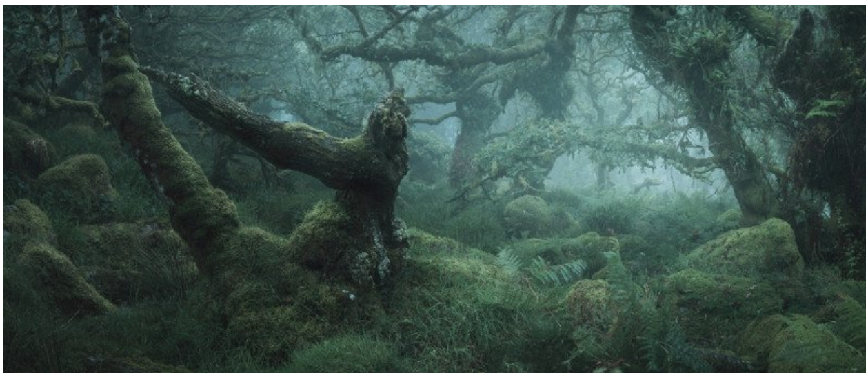
Wistman's Wood

Burnell tells Colossal that although he has visited the wood around 20 times in just the past year, it has only been misty on two of the trips. He also tries to visit during blue hour immediately before the sun rises in the morning. The photographer says he'll continue to visit Wistman's Wood and hunt for the right weather and lighting conditions to add to this series. You can follow along and find more of Burnell's work on his website , Facebook , Twitter , and Instagram .